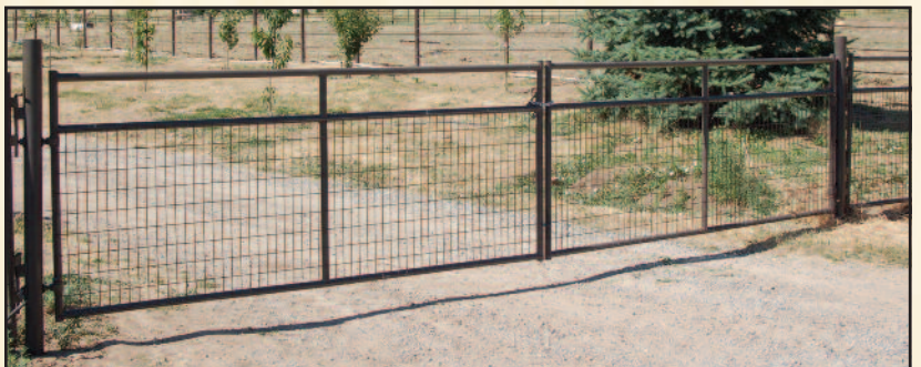
Wire Filled Double Gate