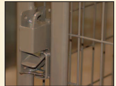
Slam latch with pad lock capability for extra security