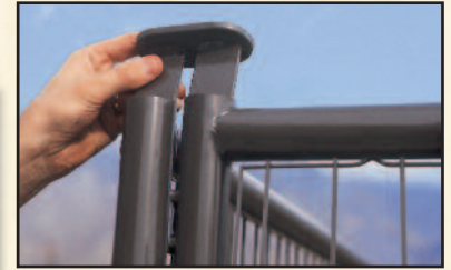
2-way Connector for Corners

P owder River's Dog Kennels continue to improve to better meet the needs of you and your dog. Some of the latest improvements include: Lockable slam latch, heavier hinge, center framed wire for reversibility, wider door opening to accommodate portable kennels, mowers, etc. The kennels are constructed from all steel 18-gauge, 1.66-inch diameter frame and 8-gauge wire. Two connectors are included with each kennel section.