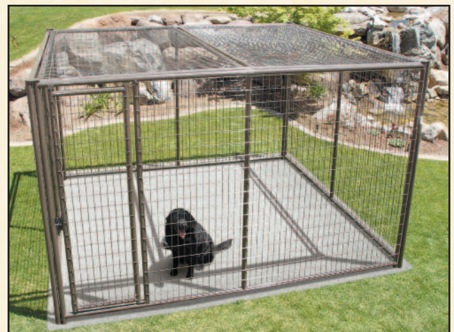
Kennel Tops Optional (Sold Separately)

Keep those climbing dogs in with Powder River's Kennel Top. It can be attached in a matter of minutes. The top gives the kennel a variety of uses such as chickens, birds, monkeys, etc.