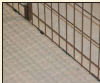
Snap-in connectors ensure solid connection of panels to floor