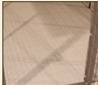
Built in Floor – No more Digging under the kennel