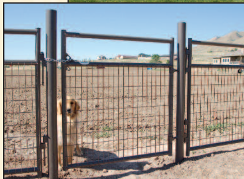
< 4-Foot Wire Filled Gate