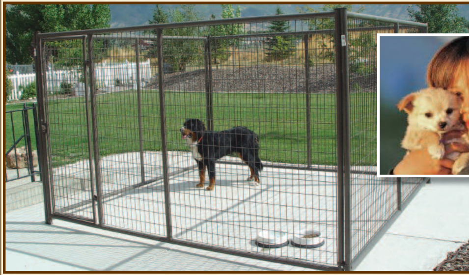
10' x 5' Dog Kennel and 10' x 10' Dog Kennel

P owder River's Dog Kennels continue to improve to better meet the needs of you and your dog. Some of the latest improvements include: Lockable slam latch, heavier hinge, center framed wire for reversibility, wider door opening to accommodate portable kennels, mowers, etc. The kennels are constructed from all steel 18-gauge, 1.66-inch diameter frame and 8-gauge wire. Two connectors are included with each kennel section.