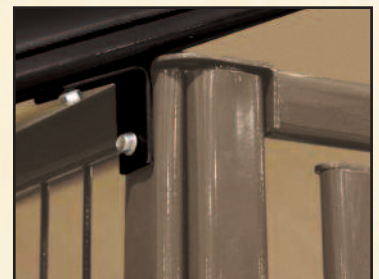
Quick and easy to connect optional roof structure