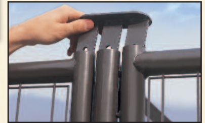
3-way Connector (sold separately)