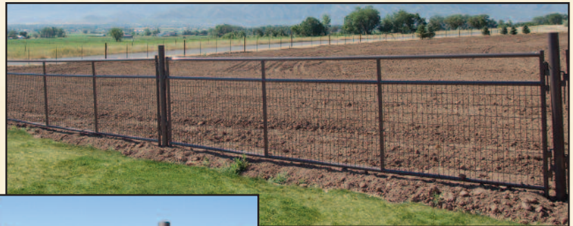
16-foot Wire Filled Panels