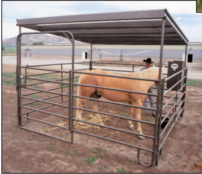
10' and 12' Combo Panel available in 5-Rail Order No. 027-11010 and 027-11012