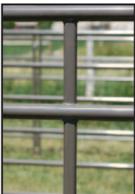
In-line Vertical Stays