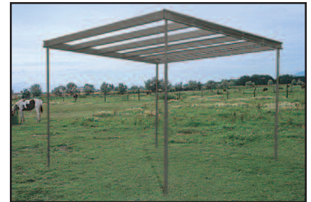
12- x 12-foot Horse Shelter Order No. 055-05000