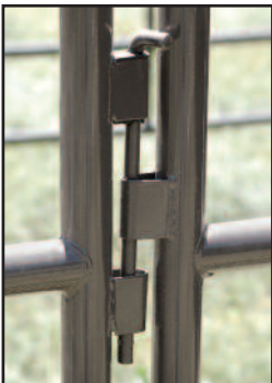
Drop-pin and Clip Connectors