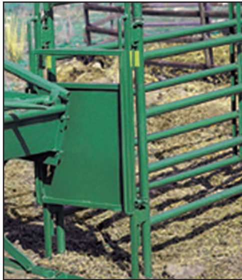
Calf Alley Tailgate

Optional headboard w/tie-down chain available