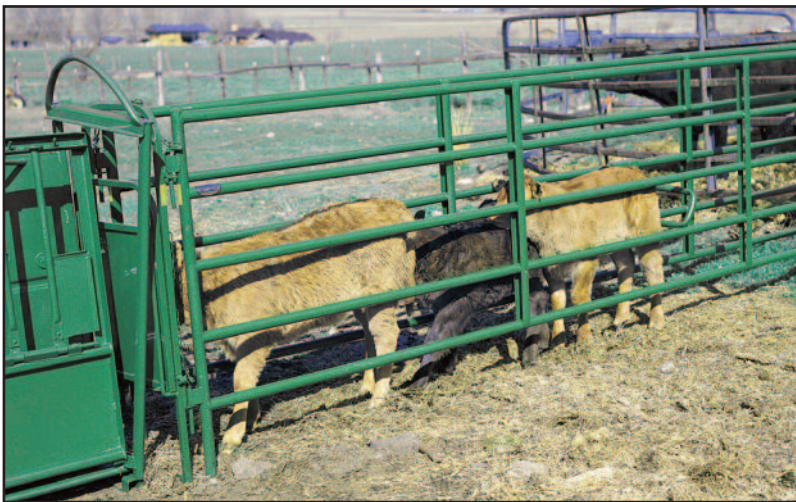
Calf Alley Panels

Mount this positive alley stop near the entrance of your calf alley. Once calves pass through this stop, they cannot back up. The calf alley stop will mount anywhere in the alley.