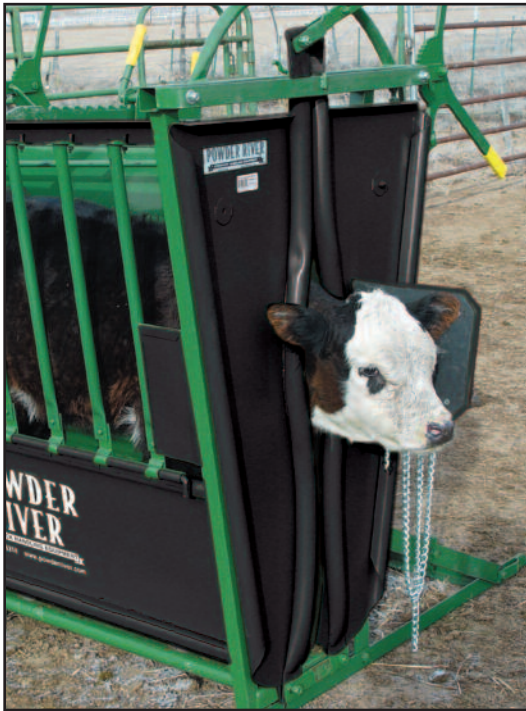
CALF TABLE HEADBOARD

Optional headboard w/tie-down chain available