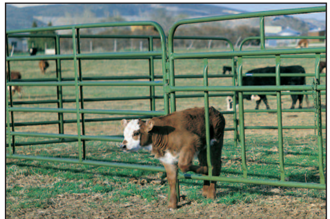
12-foot Calf Pass Panel

These 52-inch high, 5-rail tube panels connect to any Powder River panels. Use these panels to push calves from any working system into the calf table. These panels are high enough to keep calves in the alley, but low enough to easily work the animals.