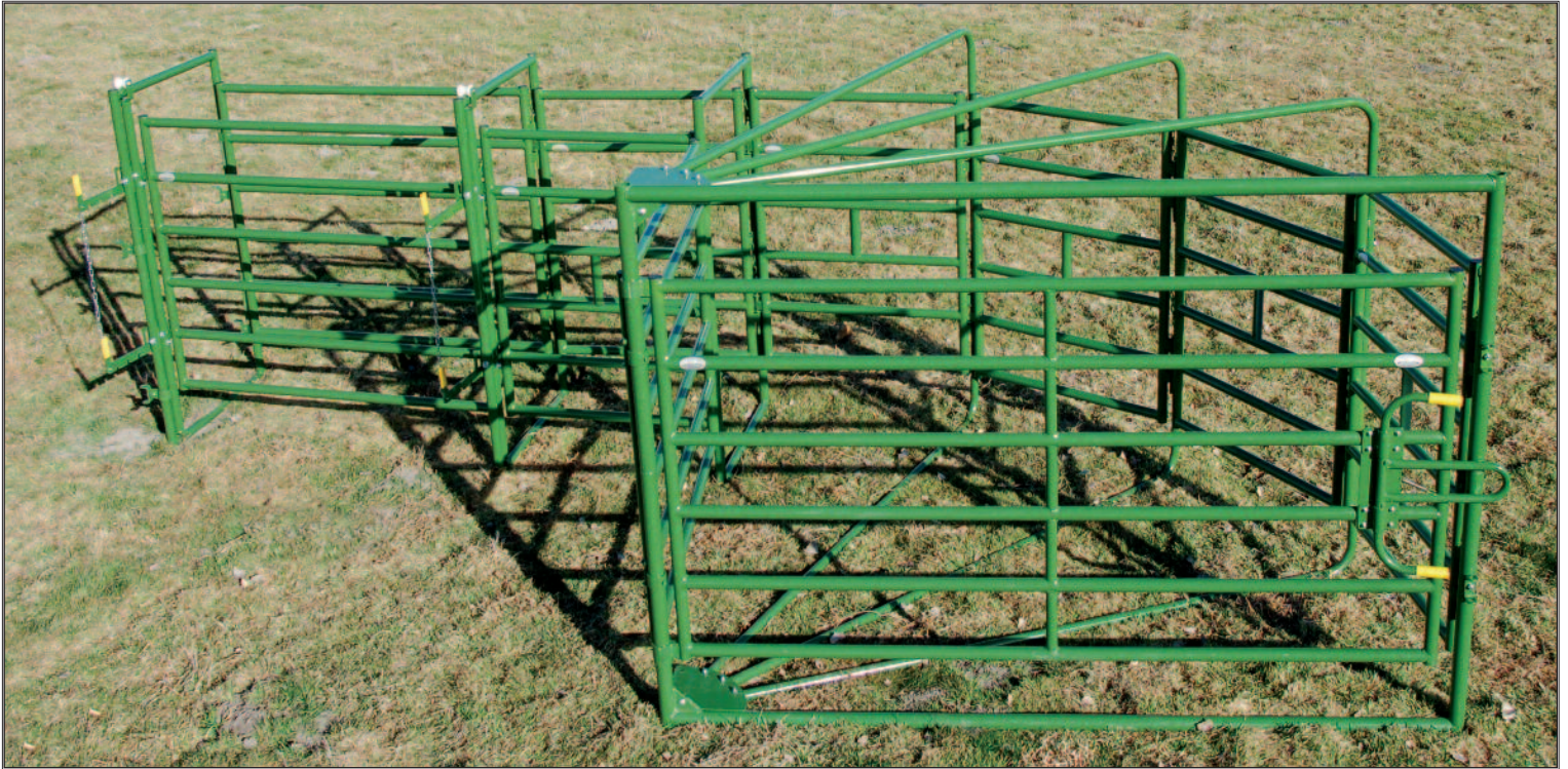
PRXL7 Tub and Alley Package Order No. 010-50100 2-inch Tube, 72-inch High